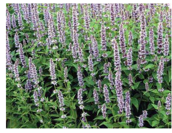
Agastache foeniculum (Anise Hyssop) The anise scent of this flower deters herbivores and some insects.