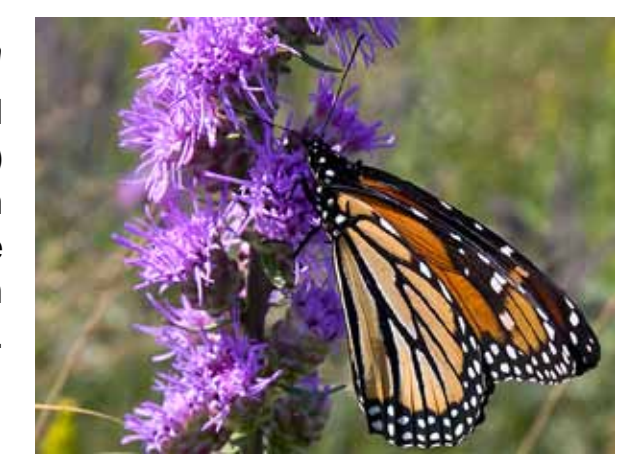
Liatris punctata (Dotted Blazing Star) Adult Monarch Butterflies love the necter from these flowers.