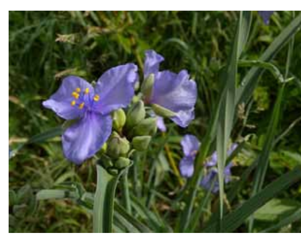
Tradescantia ohiensis (Ohio Spiderwort) This flower changes from blue to violet when air pollution is present.