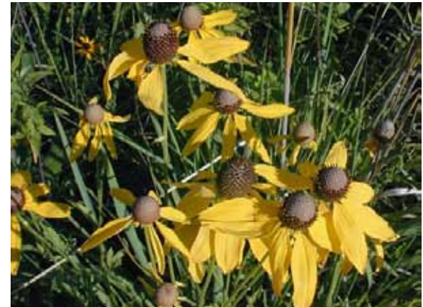
Ratibida pinnata (Gray-headed Coneflower) Seeds of this flower are eaten by Goldfinches.