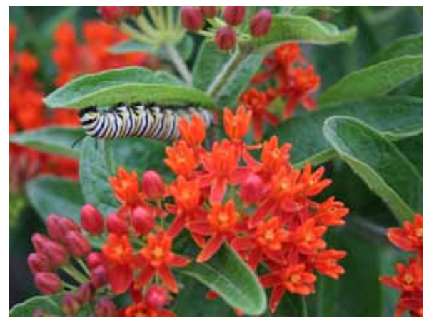
Asclepias tuberosa (Butterfly Milkweed) Monarch Butterfly caterpillars consume the foliage.