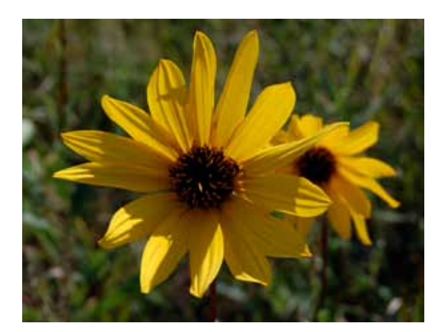
Helianthus pauciflorus (Prairie Sunflower) The roots are eaten by gophers.