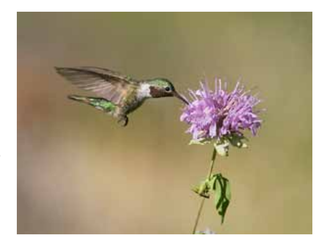
Monarda fistulosa (Wild Bergamot) The Ruby Throated Hummingbird drinks from these flowers.