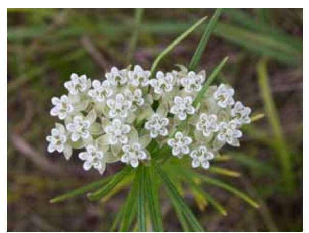
Asclepias verticillata (Whorled Milkweed) Milkweed leaves are the only food of the Monarch Butterfly larva.