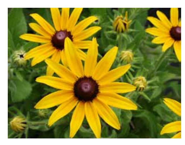
Rudbeckia hirta (Black-Eyed Susan) Most herbivores won't eat the leaves because they are too coarse and possibly poisonous.