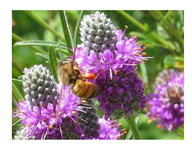
Dalea purpurea (Purple Prairie Clover) This flower attracts 10 different types of bees.