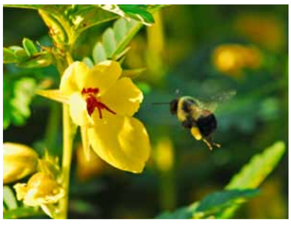
Chamaecrista fasciculata (Partridge Pea) These flowers are usually pollinated by insects but can sometimes self-pollinate.